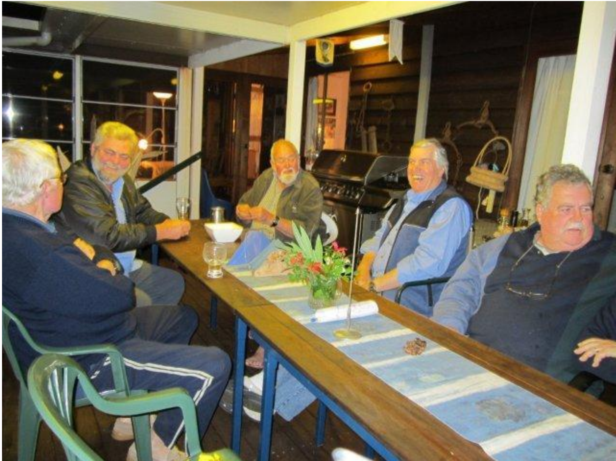
Secret Men's Business