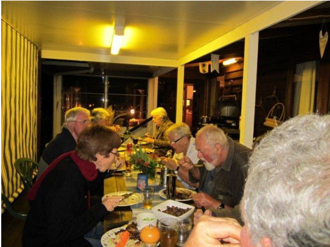
Saturday night – dinner is served