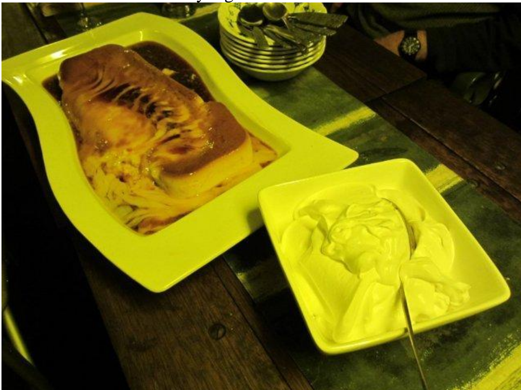
Crème Caramel for dessert