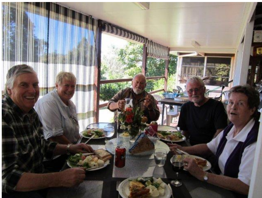
Saturday Lunch on the verandah