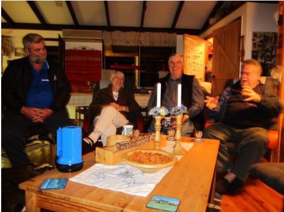
Ross tall story telling