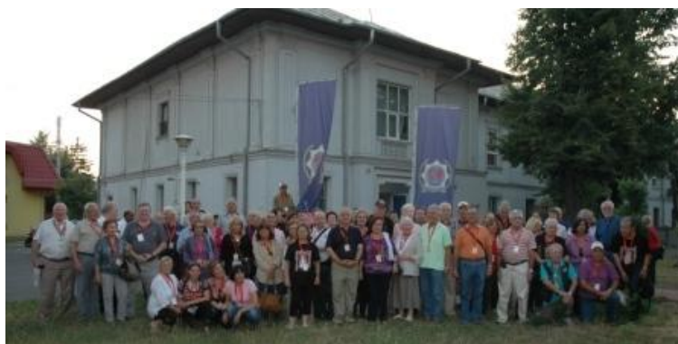
The Friendship Week members outside IPA office, Bucharest.

The Friendship Week was declared by all participants to be one of the best in recent years. It started with a tour of sights in Bucharest including the massive parliament building. An alternative visit to a folk park was offered to those who had already seen the parliament during the IEC social programme. The IPA members from 11 countries and 4 continents then travelled through majestic countryside to the Alpin hotel in the ski resort of Brasov. Tours included a visit to Vlad Dracul's castle in Bran, the royal palaces in Peles, the superb clock tower and the mayor's parlour in Sighisoara, where the group were joined by the Hollywood film star, Harvey Keitel, who was filming in the city. Well done to IPA Romania.