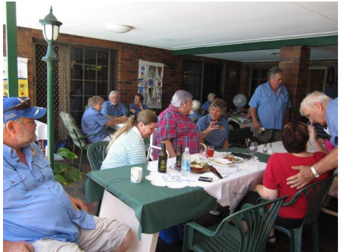
Time for a chat