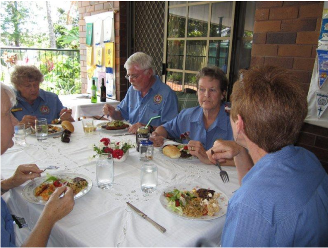
The food is good