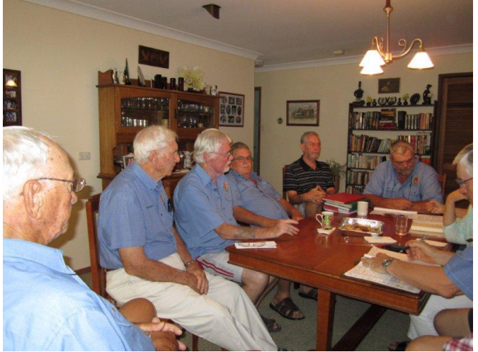
Committee at work