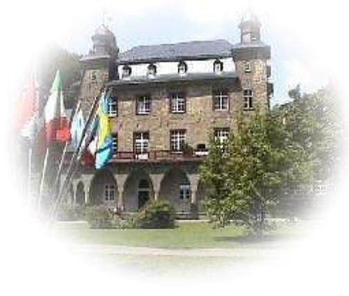
IBZ Gimborn Castle - the IPA's educational establishment

Further information is available by downloading the accompanying document